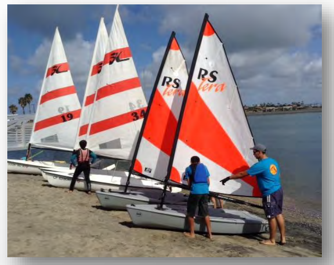
Aquatic Center Grants